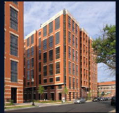
Senate Square Washington, DC