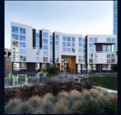
Rincon Green San Francisco, CA