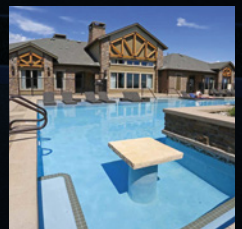
Camden Flatirons Broomfield, CO